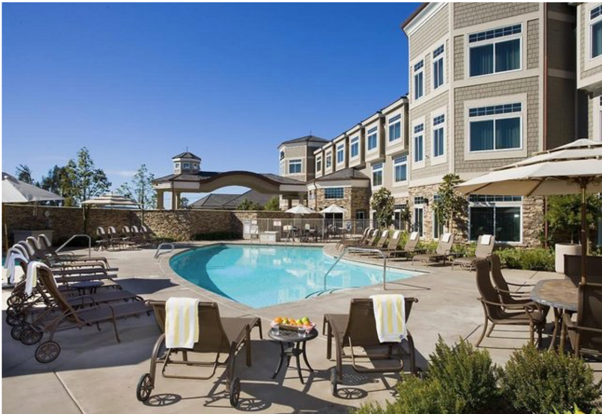
Carlsbad's West Inn & Suites offers modern boutique lodging, and free shuttle service to Legoland, as well as to the beaches nearby.

POSTED: 07/28/2015 10:00:00 AM PDT | UPDATED: 3 DAYS AGO